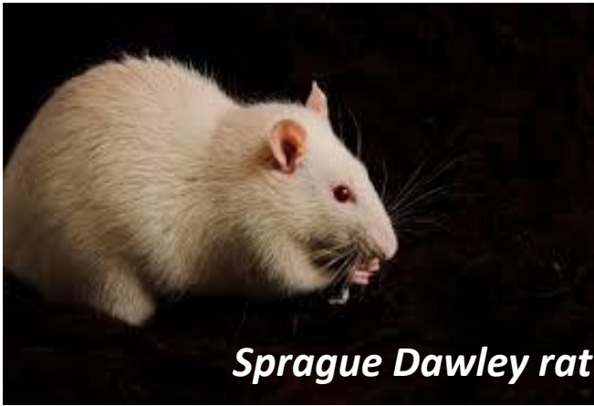
Sprague Dawley rat