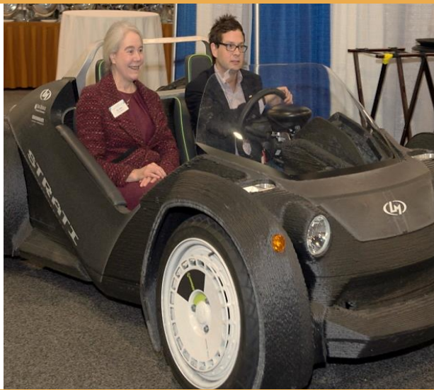
Highly Selected Showcase